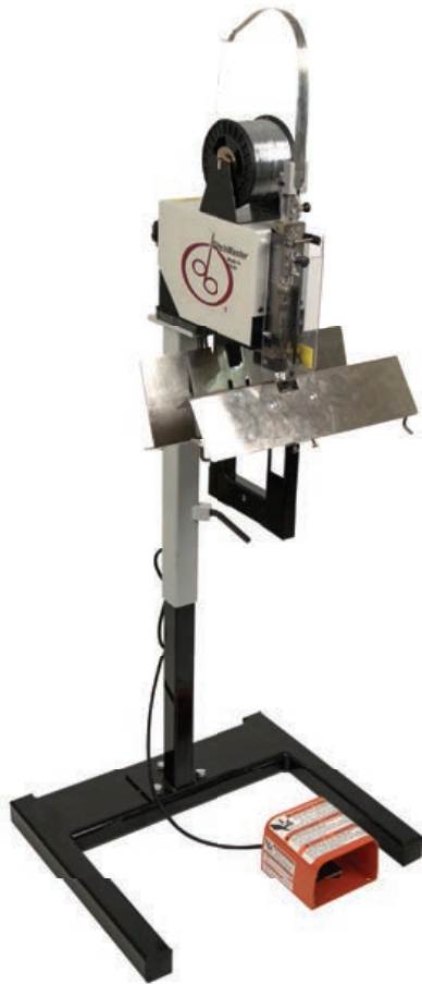
(DeLuxe StitchMaster High Performance w/stand)

The DeLuxe Stitcher StitchMaster High Performance is the Graphic Arts Industry's premier, portable, high-quality stitcher. It is quiet, fast, dependable and inexpensive; ideally suited for small print shops.